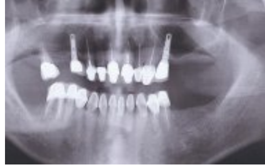
11 avr. 2013 | Implantology International Prevention of failures in oral implantology