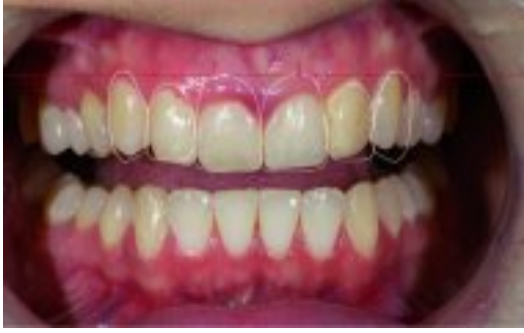
28 oct. 2015 | Implantology International Digital implantology— Predictable aesthetics and functional results